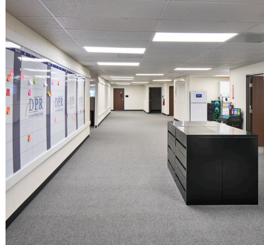
120'x60' Office Building