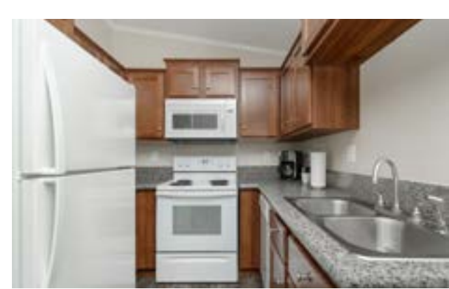
Don't miss out on our 20 Studio Apartments available for immediate sale. Act now before they're gone!