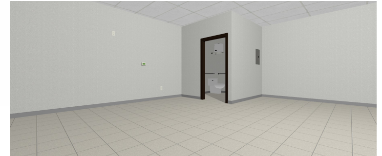
View into restroom