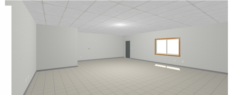
View toward the main exit door